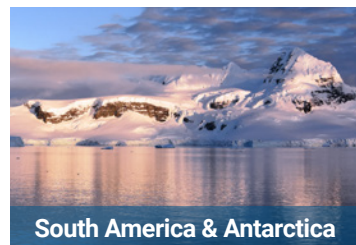
South America & Antarctica

GENERAL TERMS APPLICABLE TO ALL OFFERS IN THIS CAMPAIGN ("Offer"): Offer is available to legal residents of North America. Offer may not combine with other offers or promotions. Other exclusions may apply. Changes or refunds may not be permitted. Offer and its parts (if any) are not transferrable, not substitutable, and not redeemable for cash. Princess Cruise Lines, Ltd. ("PCL") is not responsible or liable for any printing errors. Offer may be changed or revoked at any time. A refundable deposit is required for all stateroom guests and amount varies according to the cruise length, stateroom type and number of stateroom guests. Please refer to princess.com for terms, conditions and definitions that apply to all bookings.