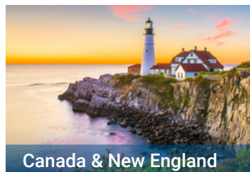
Canada & New England